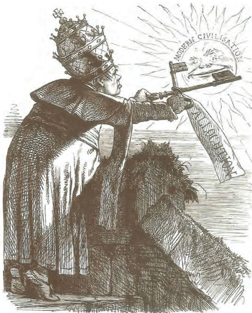
Papal Allocution.—Snuffing out Modern Civilisation.

2 Look at the cartoon, and then answer the questions which follow.