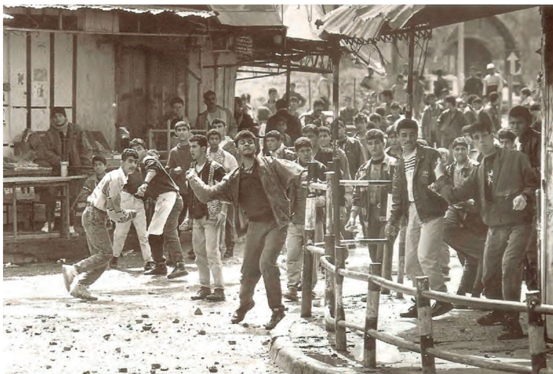
A photograph of young Palestinians throwing stones at Israeli soldiers in Gaza in 1987.

21 Look at the photograph, and then answer the questions which follow.