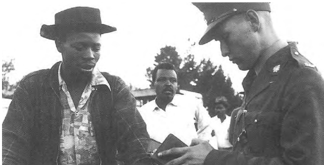
A photograph of a policeman inspecting the pass belonging to a black South African.

18 Look at the photograph, and then answer the questions which follow.