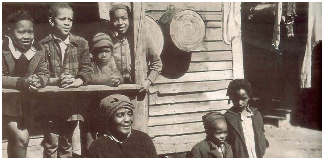
A photograph of a black family at home in the southern state of Virginia, during the 1920s.

13 Look at the photograph, and then answer the questions which follow.