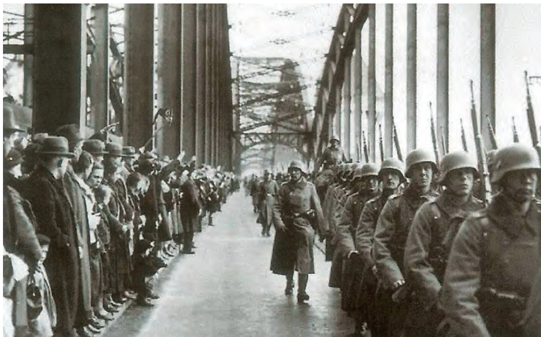
A photograph of German forces crossing the Cologne Bridge to enter the Rhineland in 1936.